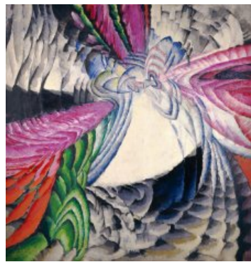
(c) 2012 Artists Rights Society (ARS), New York / ADAGP, Paris.