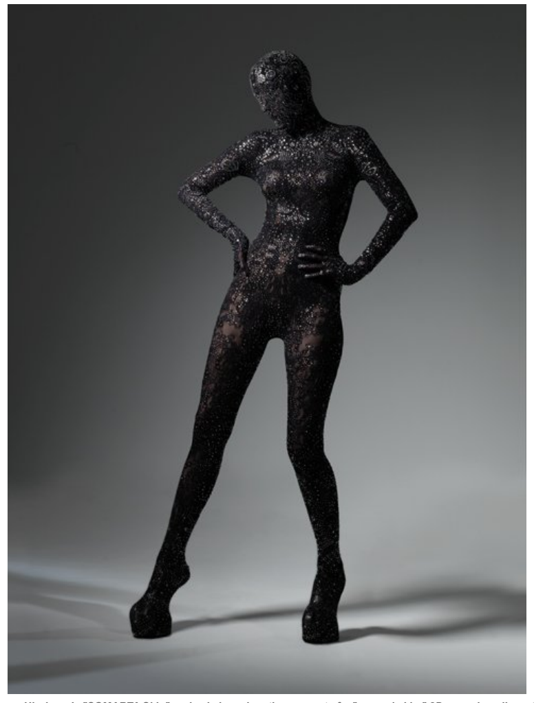
Tamae Hirokawa's "SOMARTA Skin" series is based on the concept of a "second skin." 3D scanning allows the garments to be seamless and perfectly form fitting.

Labaco presents the exhibition in such a way that the tech-savvy crowd will not find it over-simplified -- and those less familiar will actually understand it. After all, not everyone is expected to know what Computer Numerically Controlled (CNC), machining and digital knitting are ... just yet.