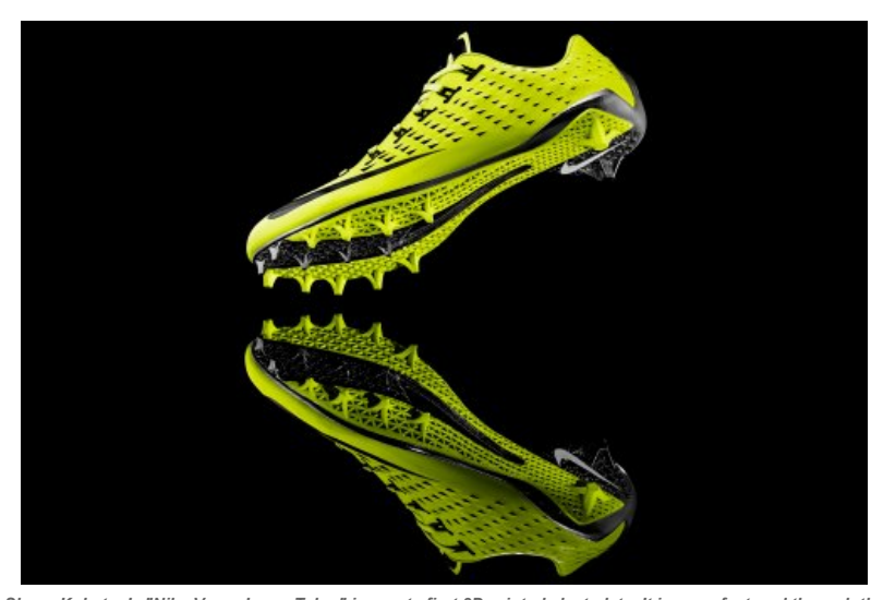
Shane Kohatsu's "Nike Vapor Laser Talon" is sports first 3D printed cleat plate. It is manufactured through the use of Selective Laser Sintering (SLS) - a technique that fuses small particles of matter together with high-

If fashion is more your forte, there are even pieces of haute couture and sportswear in the show. For "Remixing the Figure," Tamae Hirokawa's SOMARTA Skin series features high-quality bodywear made from the seamless production method of whole garment knitting to ensure a perfect fit. Nike is also highlighted in "Pattern as Structure" for Shane Kohatsu's Vapor Laser Talon being the world's first 3-D printed shoe cleat plate.