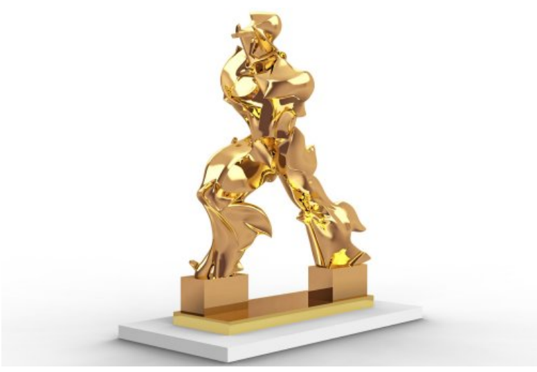
Barry X Ball's "Perfect Forms" takes inspiration from Umberto Boccioni's Futurist sculpture remixing it to create a contemporary rendition through the use of 3D scanning, digital modeling, 3D printing/laser sintering. and CNC milling.

"Rebooting Revivals" focuses on works that have been created by looking to the past for inspiration. Barry X Ball, a New York based sculptor, took inspiration directly from Umberto Boccioni's 1913 Futurist work Unique Forms of Continuity in Space . The mirror-polished 24-karat gold on nickel sculpture, Perfect Forms , literally takes an iconic sculpture and puts it through the technological ringer.